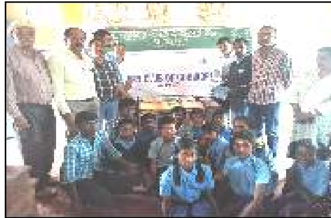
Govt.Model Primary School, T. Shettigeri. 5 th Aug 2019