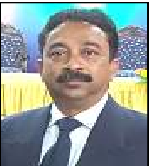
NEWIN.K.B PRESIDENT 2019-20

CHARTER NO: 55551; CHARTER YEAR:2001; 3181; ZONE 6 ; VOL 19; ISSUE NO 3; AUGUST 2019