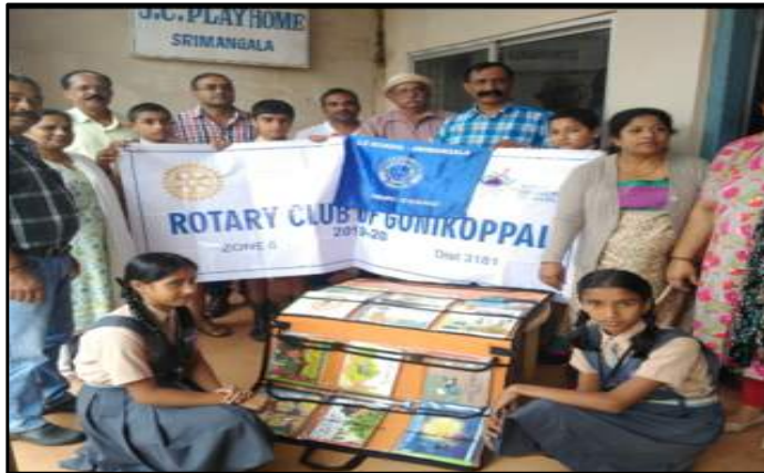
JC School , Srimangala ; 5 th Aug 2019