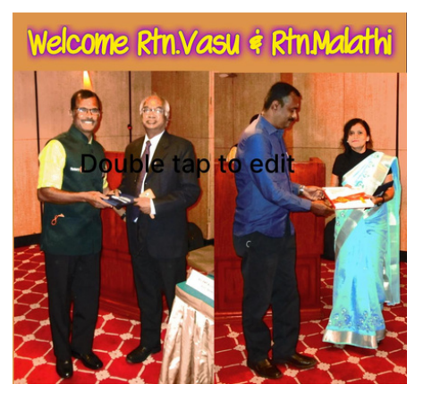
New Member Induction