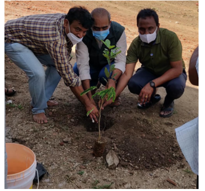
Tree Plantation drive on September 12th and 18th at 3 places